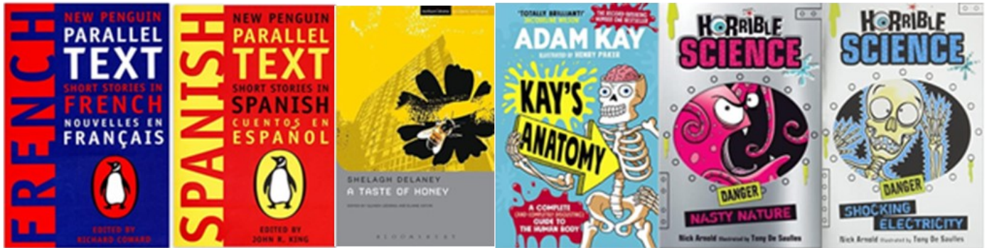
Modern Foreign Languages